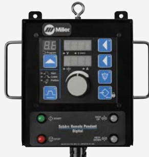
Remote Pendant Digital

Point-of-use installation. Remote Pendant can be handheld or secured at point of use to improve operation.