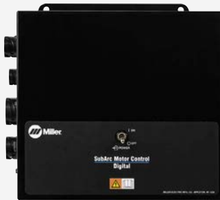
Motor Control Digital